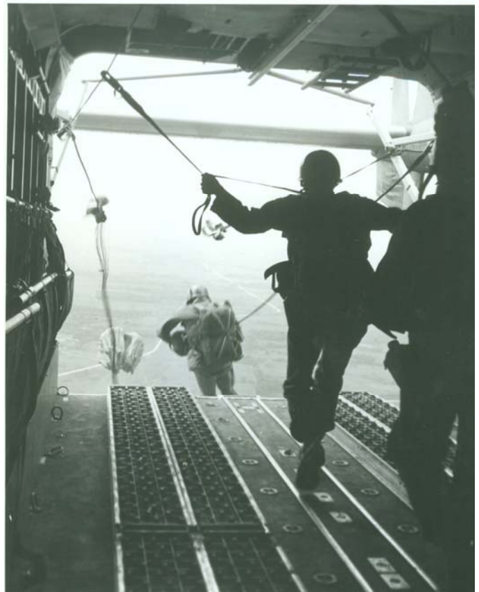
Fort Benning Jump From a Flying Boxcar with Clamshell Doors Off