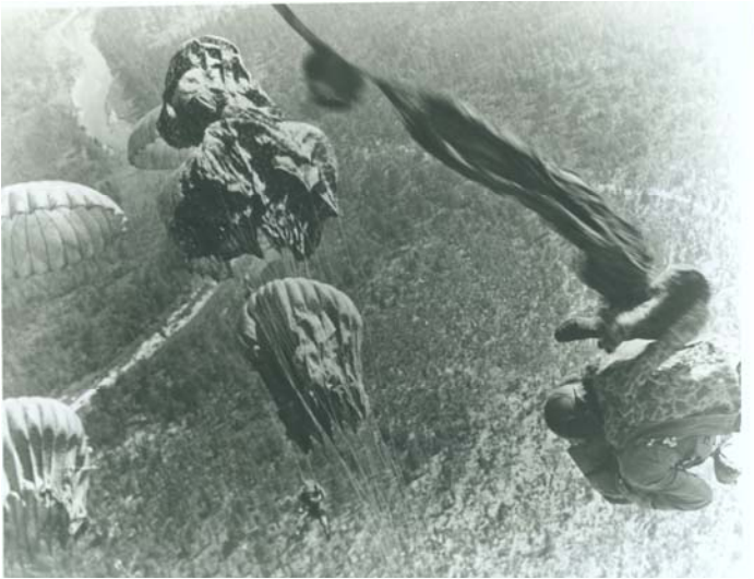
Jumping T-7's at Fort Benning