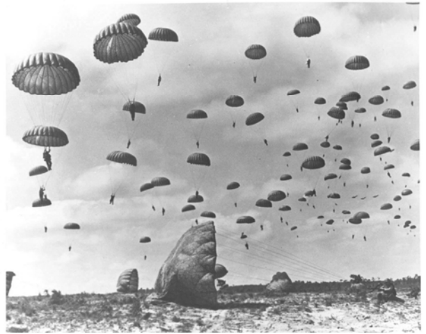
Mass Jump of T-7's at Fort Benning