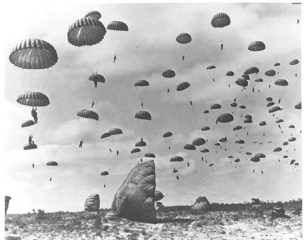
Mass Jump of T-7's at Fort Benning