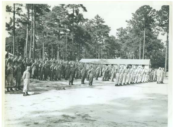
Sand Hill Formation When It Was Announced that 800 Men would be Reassigned to the 82nd