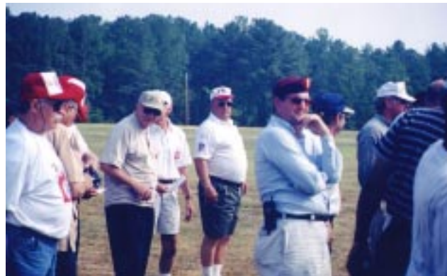
The "Magnificent Seven" at All American Week -2000