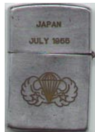
Submitted by Mel Echelberger

Ed's note: An obviously used Zippo. I'm not sure that such a dangerous weapon as this would be allowed in one's possession in today's politically correct Army!