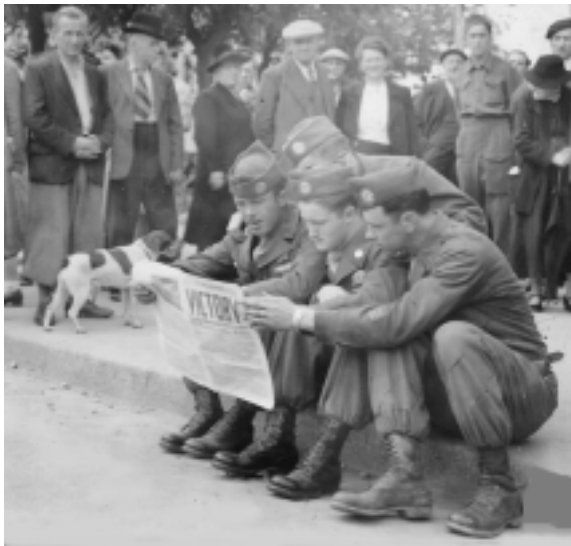
508 th PIR troopers - VE Day in Chartres, France

Perhaps the date of May 8 brings back old memories for 508 th PIR troopers. At that time in 1945 the PIR was at Chartres and Dreux, France awaiting the possibility of another airborne operation to liberate POW camps should the need arise. Enough cannot be said of the tremendous contributions made by the officers and men of the 508 th PIR in bringing about the fall of Germany and peace to Europe once again. We, of the 508 th Airborne Chapter, salute our brothers in arms!